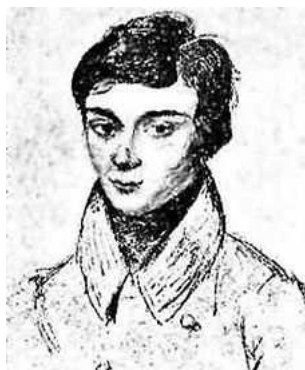
Figure 7.1: Evariste Galois (1811-1832)

F -automorphism of E . Thus there are exactly n = [E : F] F -automorphisms of E .