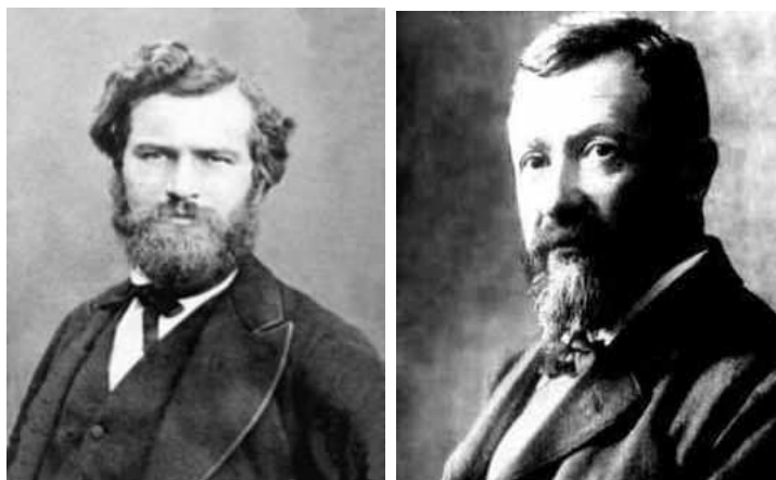
Figure 1.5: Camille Jordan (1838–1922) and Otto Hölder (1859–1937)

cannot be refined, so it must be a composition series. In particular G \simeq G/\{1\} is simple. This is also the only composition series for G and so all the assertions are true for length 1.