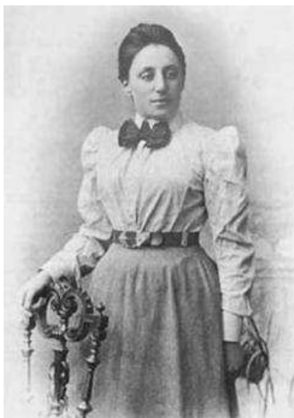
Figure 3.1: Amalie Emmy Noether (1882-1935)

Examples 3.12. 1. Consider the polynomial ring in infinitely many indeterminates X_1, X_2, \dots over \mathbb{R} . The chain