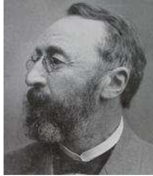
Figure 1.3: Ludwig Sylow (1832-1918)