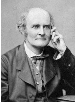
Figure 1.2: Arthur Cayley (1821-1895): he was the first to define the concept of a group in the modern way. Before him, groups referred to permutation groups.

Definition 1.22. The group G acts on the set X if for all g \in G , there is a map