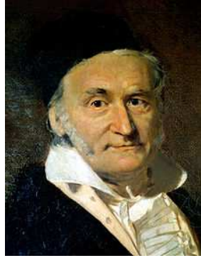
Figure 3.2: Carl Friedrich Gauss (1777-1855)

We can now rule out the above example, and we will prove later that this allows us to say that a primitive polynomial is irreducible if and only if it cannot be factored into two polynomials of lower degree. Be careful however that “primitive polynomial” has a different meaning if it is defined over a field.