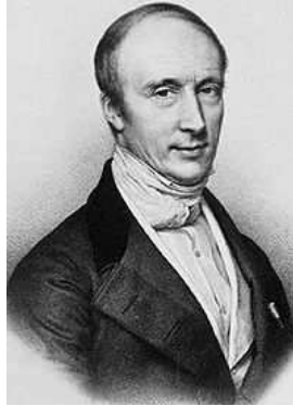
Figure 1.4: Augustin Louis Cauchy (1789-1857)

Clearly p^{n(n-1)/2} is the highest power of p that divides G , we thus have to find a subgroup of G of that order. Consider the set U(p, n) of n \times n upper triangular matrices with every diagonal coefficient at 1 and elements of \mathbb{F}_p above. This is clearly a subgroup of G , since such matrices are invertible and form a group. Its cardinality is p^{n(n-1)/2} as wanted (there are n(n-1)/2 coefficients above the diagonal, which can take any value mod p ).