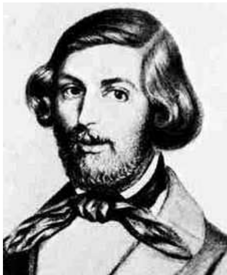
Figure 3.3: Ferdinand Eisenstein (1823-1852)

Proof. We first divide f by its content, to get a primitive polynomial. By the above proposition, it is enough to prove that this primitive polynomial is irreducible over D .